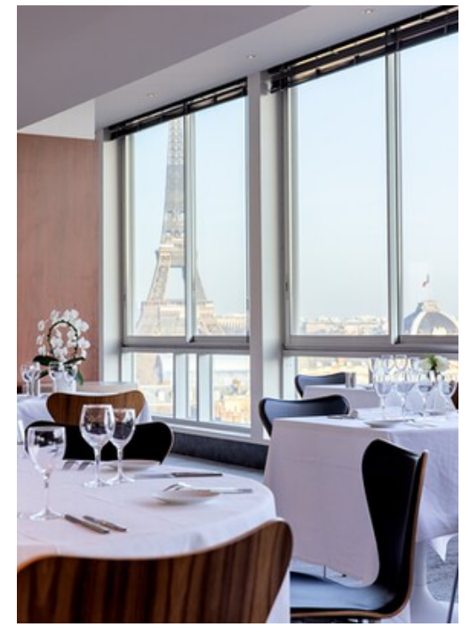
View from the 7th floor restaurant