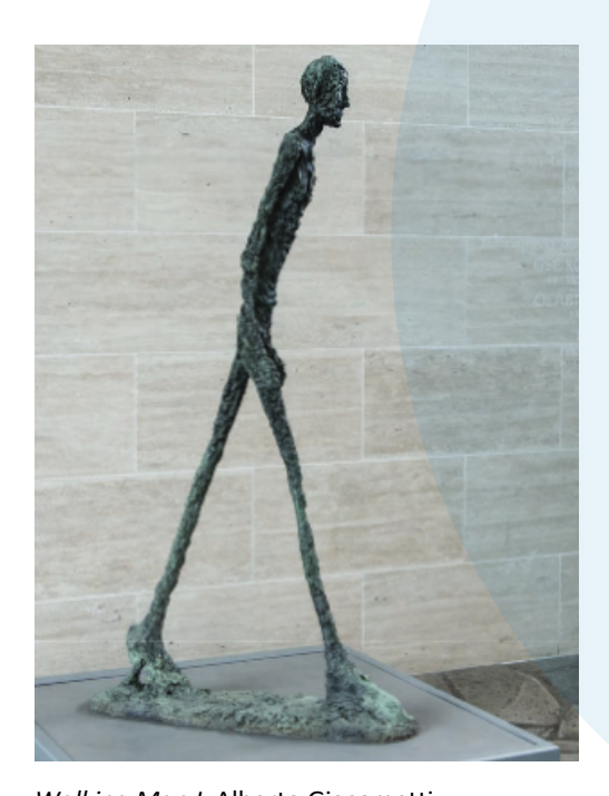
Walking Man I, Alberto Giacometti

The UNESCO Headquarters currently possess the richest artistic heritage among the <u>United Nations</u> bodies. The works currently exhibited in the UNESCO buildings bear witness to the richness of artistic diversity in the world, which stretches out over more than 6000 years of history. You can view the collection here: <u>www.unesco.org/artcollection</u>