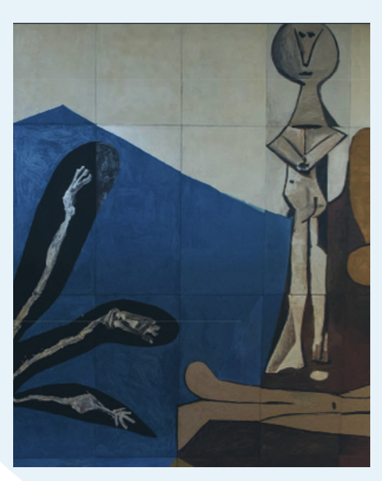
The Fall of Icarus, Pablo Picasso